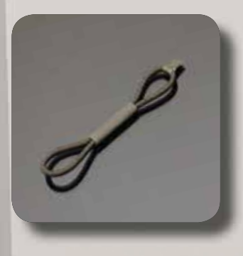
Oboe special band Artikel-Nr. 219085