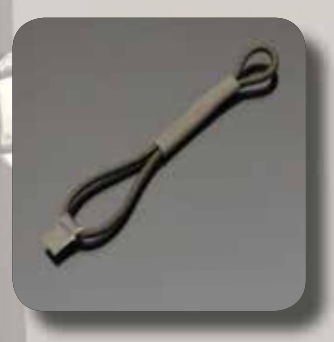
Cor Anglais special band Artikel-Nr. 219086