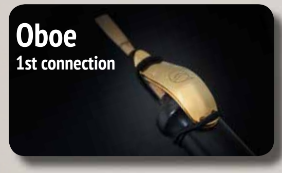
55 mm Xtra Curved