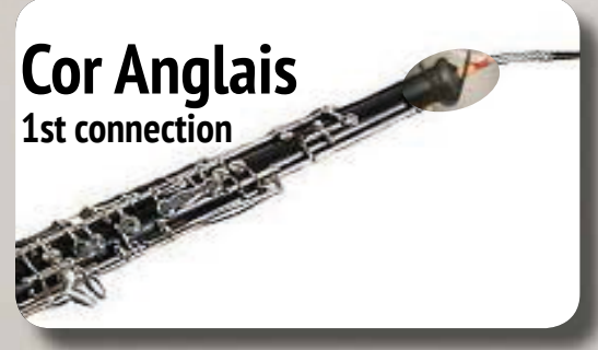
55 mm Xtra Curved