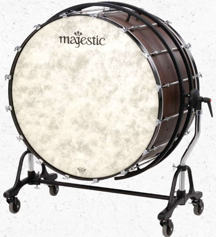
Prophonic with unique double ring full suspension system.