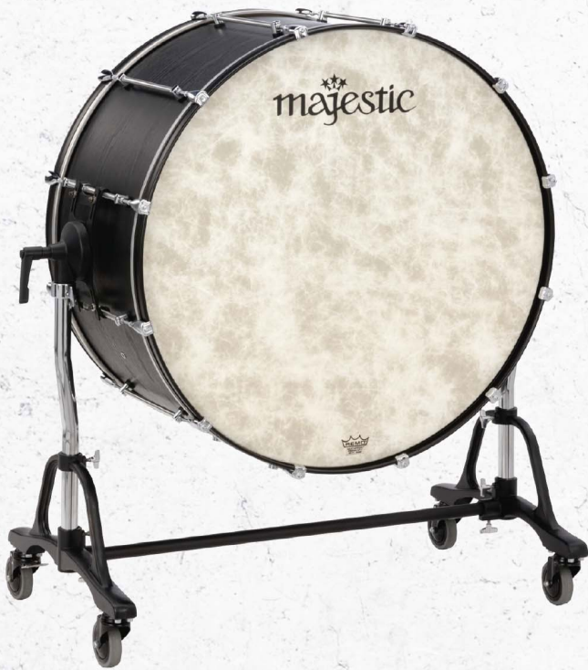
Concert Black with lug mounted suspension system.

For the development of its bass drums, Majestic made use of advanced technologies. Its suspension system and Fiberskin heads are wonderful and its 360° adjustable frame makes it very easy to use. Available in several sizes.