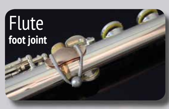
33 mm or 41 mm