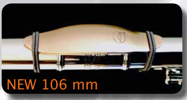
Alto flute and lower, to bridge the barrel 106 mm & 2 x 70mm band