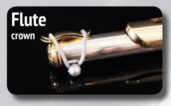
33 mm or 41 mm