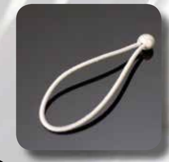
70 mm band for headjoint Artikel Nr. 219077