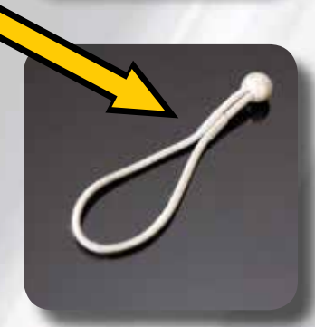
special band foot joint Artikel Nr. 219088