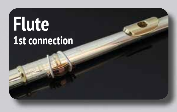
33 mm or 41 mm