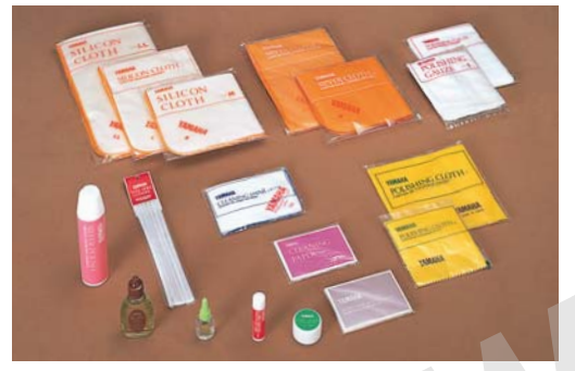
Yamaha offers a vast array of accessories and maintenance products. All have been carefully designed and tested to help you take the best possible care of your instrument.