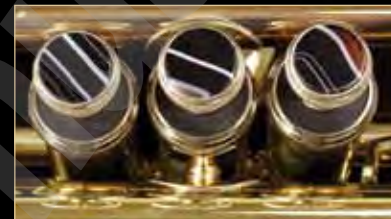
Black and White Sardonyx