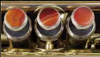
Brazilian Agate - Agate varies in colorization