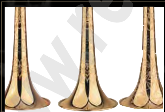
*Bach trombones are available in three handsomely hand-engraved bell patterns: anniversary, standard, and deluxe (pictured left to right).

Mouthpipes for trombone models 12, 16/LT16M are interchangeable. - specifications subject to change