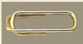
E b tuning slide

Single horn in F Solid valve rotors Bell throat: medium (M) Bore: 12mm (0.472") Yellow brass Epoxy lacquer finish Mouthpiece 32C4