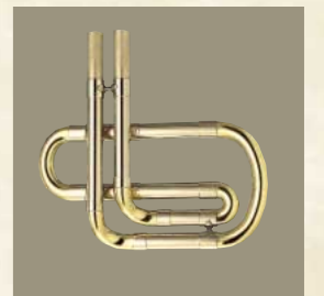
F natural slide

Single horn in B b Solid valve rotors Bell throat: medium (M) Bore: 12mm (0.472") Yellow brass A/plus stop valve Epoxy lacquer finish Mouthpiece 32C4