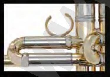
Historically significant design elements