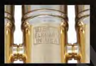
"Made in Elkhart, Indiana" valve engraving

Whether a passionate enthusiast or performing artist, experience The Artisan Collection and discover the Artisan within.