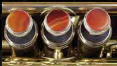
Brazilian Agate - Agate varies in colorization